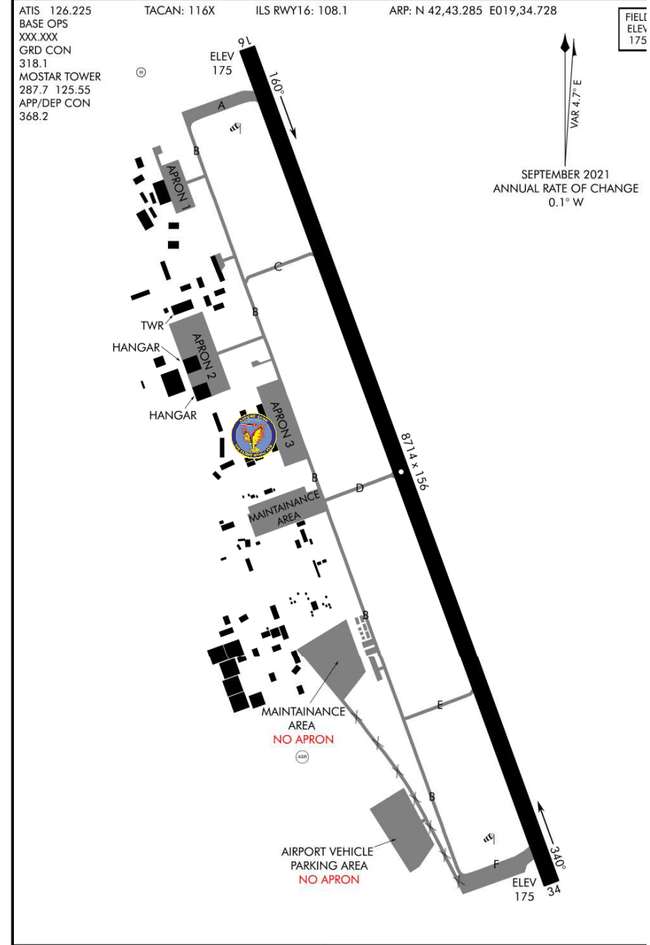
AIRPORT DIAGRAM NOT FOR REAL NAVIGATION - FALCON 4 BMS ONLY Updated: 21JAN22

MOSTAR (LQ) ORTIJEŠ, BOSNIA AND HERZEGOVINA