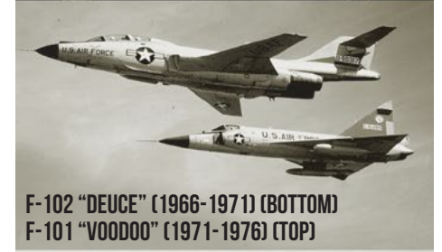
F-102 "DEUCE" (1966-1971) (BOTTOM) F-101 "VOODOO" (1971-1976) (TOP)