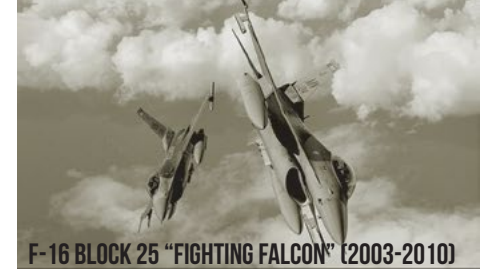
F-16 BLOCK 25 "FIGHTING FALCON" (2003-2010)