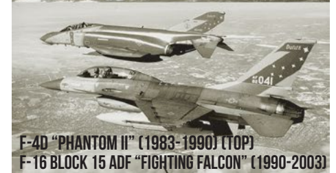
F-4D "PHANTOM II" (1983-1990) (TOP) F-16 BLOCK 15 ADF "FIGHTING FALCON" (1990-2003)