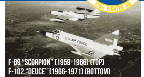
F-89 "SCORPION" (1959-1966) (TOP) F-102 "DEUCE" (1966-1971) (BOTTOM)