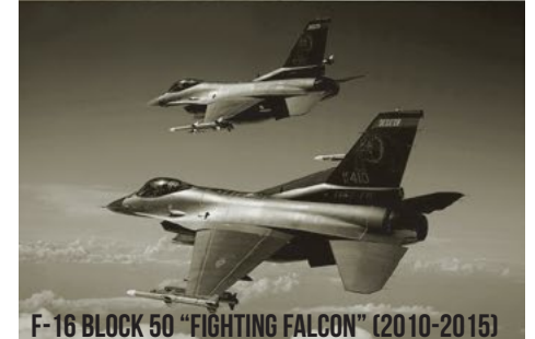
F-16 BLOCK 50 "FIGHTING FALCON" (2010-2015)