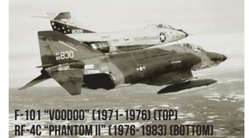
F-101 "VOODOO" (1971-1976) (TOP) RF-4C "PHANTOM II" (1976-1983) (BOTTOM)